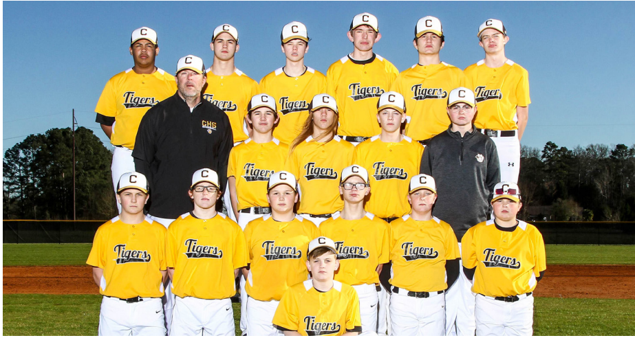
2019 C-Team Baseball Manager, Players, and Coaches