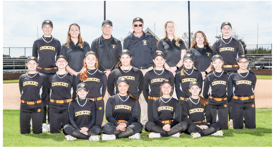
2019 SIM JV Softball Players and Coaches