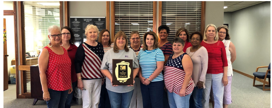
Pictured above are employees from the Iva Branch of Peoples Bank with the Award