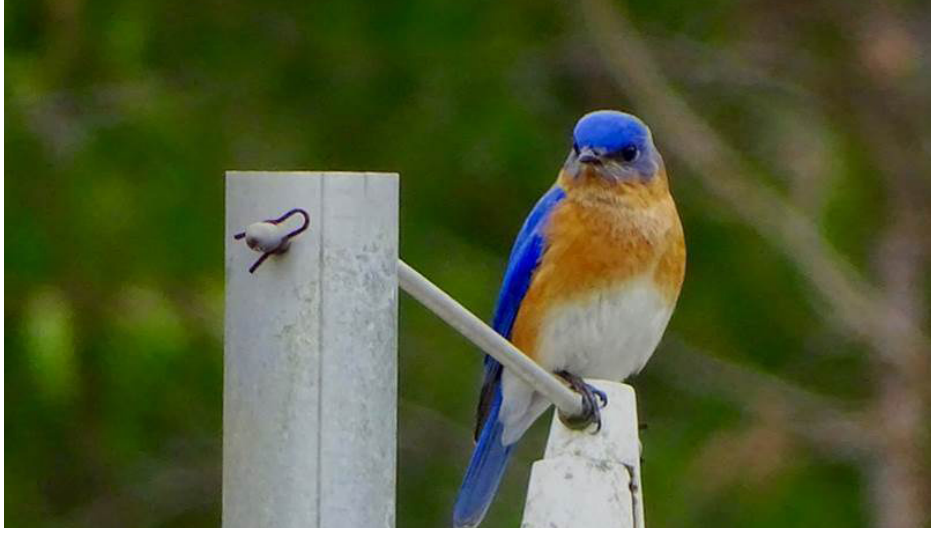
"HEY...Have you had enough of this hot weater?" Here at the Habitat it does seem like a bit much!

But, we are all blessed with the beauty of Nature.